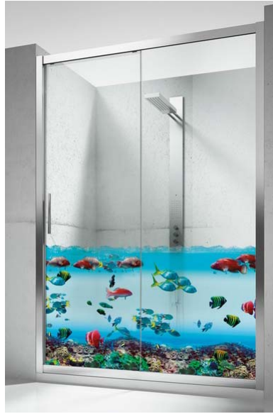
P 11 BARRIERA CORALLINA