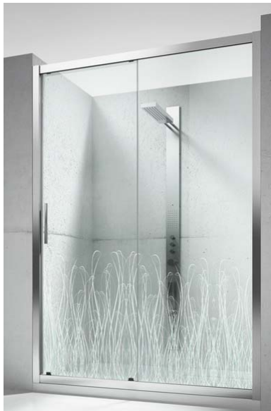
P 15 ORGANIC