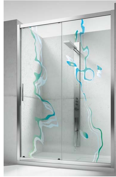
P 13 RIVOLI D'ACQUA