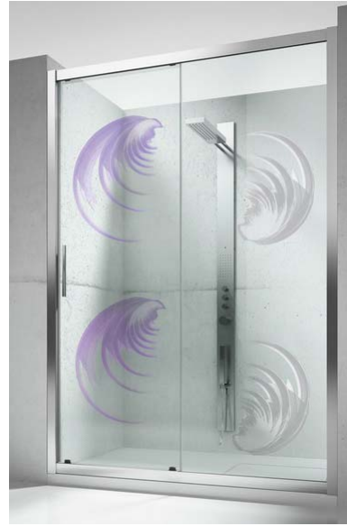
P 12 ARMONIE