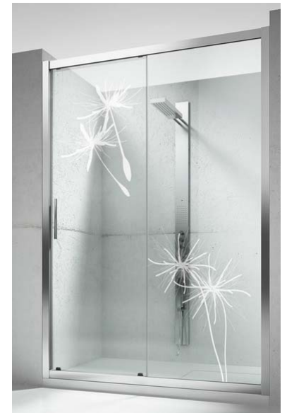
P 19 SOFFIO