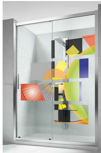
P 17 VISUAL