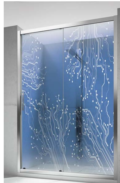
P 18 CONNESSIONI