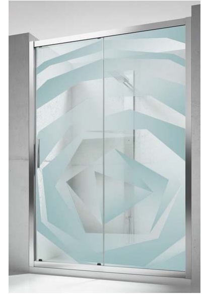
P 14 GLASS ROSE