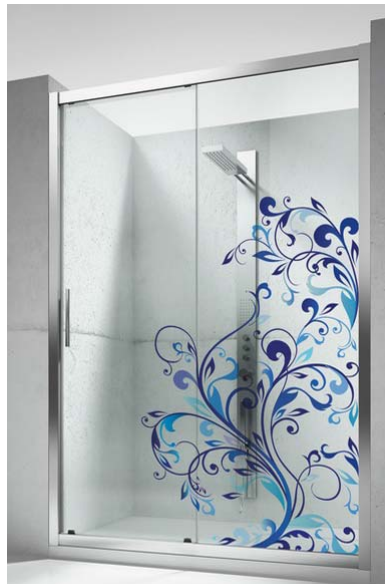
P 16 AZALEJOS